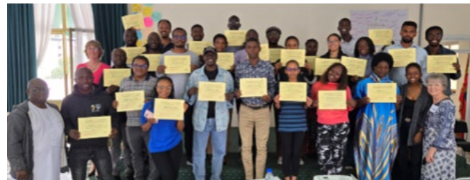
Interns and trainers in Addis Ababa proudly displaying their training certificates

Transitions: Both of our organizations (Wycliffe USA & SIL Global) are going through transitions. There can be a lot of confusion as organizations change. Wycliffe USA has just transitioned with the end of their vision (Vision 2025—to see Scripture translation started in every language that needs it by the year 2025) to a time of discerning what is the “Wycliffe of the future?” There are still over 500 languages needing translation to start, but there are also many languages with ongoing translation work and many with the New Testament but not the Old Testament Scriptures yet. So there’s lots of work still to do. SIL has been on its own journey over the past year with new leaders at Global and Africa levels. We just completed a combining of both Anglophone and Francophone regions of Africa into one SIL Africa. Tom’s role changed in 2025 to be serving as an Associate Director on the Partnerships and Resource Development team for Africa. Well, in June, Tom’s boss, Anthony Kamau will be re-assigned (again - he took his current role in June 2025) to now over-