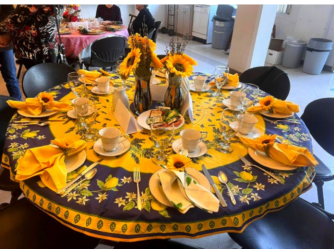
A good time was had by all at last year's tea party.