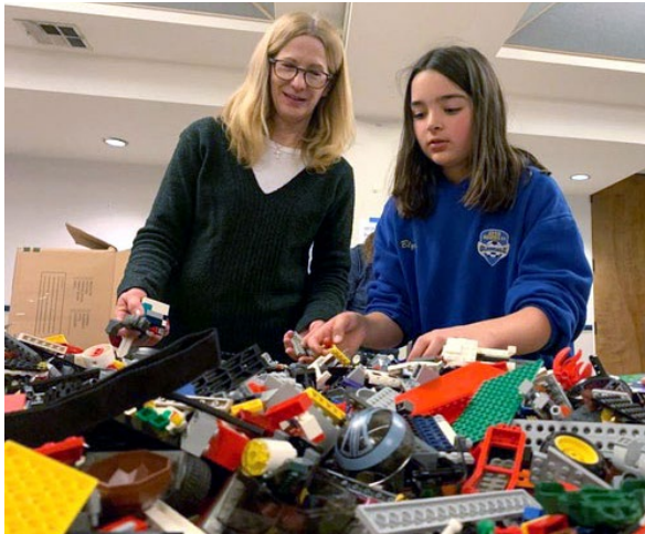
Children's Ministries held a very fun and creative LEGO Night on March 31!